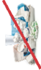
NO Foam Cups & Containers NO vasos y recipientes de poliestireno