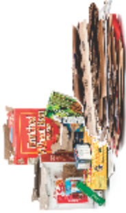
Flattened Cardboard & Paperboard Cartón y cartulina aplastados