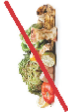
NO Food or Liquids NO comida o líquidos

DO NOT INCLUDE IN YOUR MIXED RECYCLING CONTAINER / NO INCLUIR EN SU CONTENEDOR DE RECICLAJE MIXTO