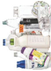
Plastic Bottles & Containers Botellas y envases de plástico