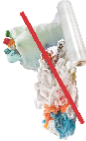
NO Loose Plastic Bags, Bagged Recyclables or Film Empty recyclables directly into your cart NO bolsas y envolturas de plástico sueltas, o materiales reciclables embolsados