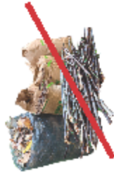
NO Green Waste NO desechos verdes