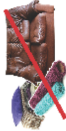
NO Clothing, Furniture & Carpet NO ropa, muebles y alfombras