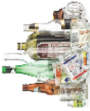
Glass Bottles & Containers Botellas y frascos de vidrio