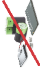
NO Batteries – check local drop-off programs for proper disposal NO baterías – Verifique los programas locales de entrega para su correcta eliminación

To Learn More Visit: Para más información, visite: wm.com/recycleright