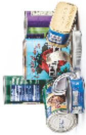
Food & Beverage Cans Latas de alimentos y bebidas